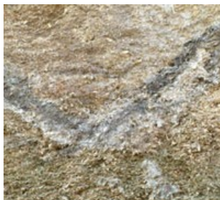
Mycotoxins are the product of mold metabolism.

While each mold produces a variety of mycotoxins, specific mycotoxins are expensive to