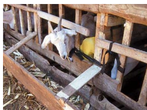
Feedback is about more than utilizing feed refusals.