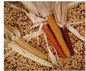
Many short-day varieties are genetically based on flinty type corn.