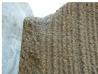
With proper moisture and packing, Silostop can virtually eliminate surface spoilage.