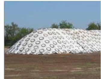
Sometimes estimating inventories isn't as simple as length x width x height.