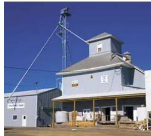
Prairie Ag Supply LLC, EST. 1998

our field staff and producer profiles in future editions that highlight our outstanding customers.