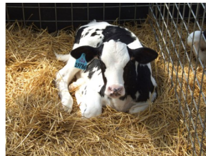
Bed calves with straw to increase gains.

straw and make sure calves are dry and free from drafts. If you do increase the amount of milk replacer fed, do so only in the first 2-3 weeks of the calf's life.